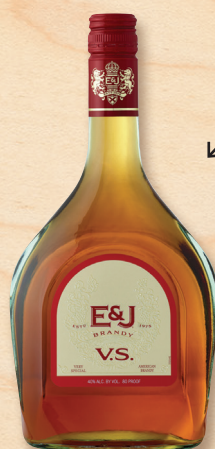
Holiday Punch made with E&J VS Brandy (750-ml.) Single Price: $9.99 ea. Member Price When You Buy 6 Price: $8.99 ea. Member Price