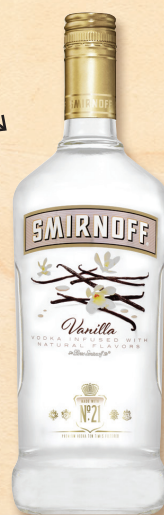
Sugar Cookie Martini made with Smirnoff Vanilla Vodka (750-ml.) Single Price: $9.99 ea. Member Price When You Buy 6 Price: $8.99 ea. Member Price