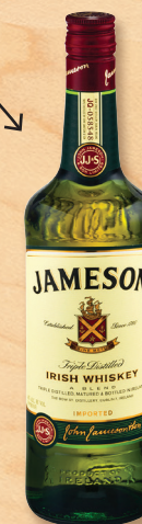
Hot Toddy made with Jameson Irish Whiskey (750-ml.) Single Price: $24.99 ea. Member Price When You Buy 6 Price: $22.49 ea. Member Price