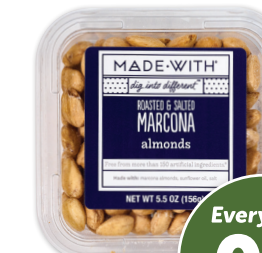
Made With Marcona Almonds 5.5-oz.