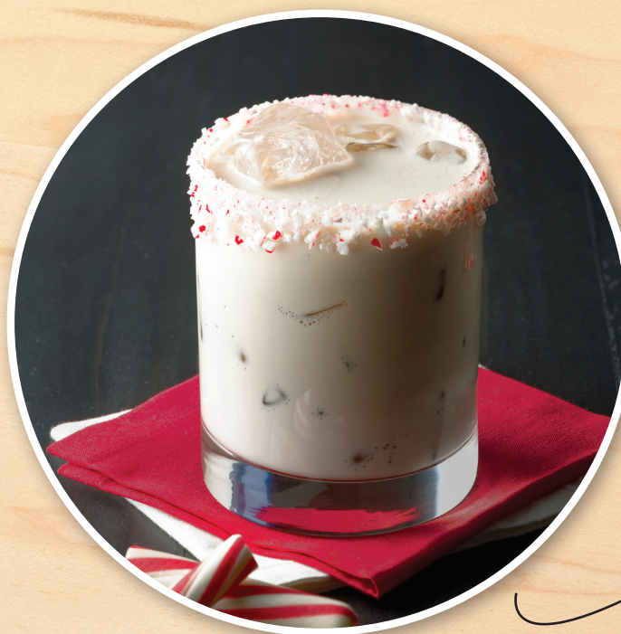
Peppermint White Russian made with Kahlúa Coffee Liqueur (750-ml.) Single Price: $21.99 ea. Member Price When You Buy 6 Price: $19.79 ea. Member Price