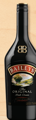
Irish Coffee made with Bailey's Irish Cream (750-ml.) Single Price: $25.99 ea. Member Price When You Buy 6 Price: $23.39 ea. Member Price