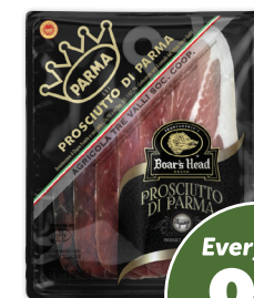
Boar's Head Prosciutto Di Parma 3-oz.