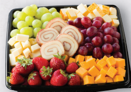
Fruit & Cheese Snack Square Serves 8-10