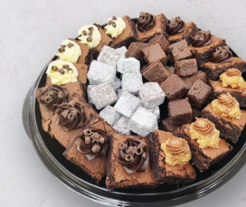
Brownie Platter Serves 20-24