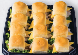
Turkey & Cheddar Slider Snack Square Serves 8-10