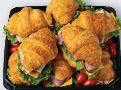
Mini Croissant Sandwich Snack Square Serves 8-10