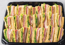
Club Finger Sandwich Snack Square Serves 8-10