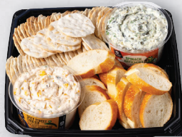
Dip, Cracker & Baguette Snack Square Serves 8-10