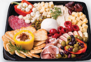
Mediterranean Tray Rectangle serves 15-20