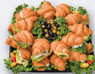
Mini Salad Croissant Sandwich Tray 16" serves 12-16 | 18" serves 16-24