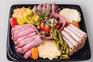
Meat & Cheese Tray 12" serves 15-20 | 16" serves 20-30 18" serves 30-40