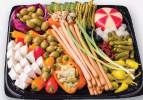
Cocktail Tray Rectangle serves 15-20