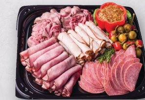
Meat Lover's Tray 12" serves 12-16 | 16" serves 20-25 18" serves 25-30