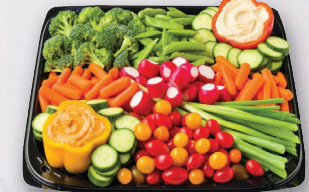
Vegetable & Hummus Tray 16" serves 20-25 | 18" serves 25-30