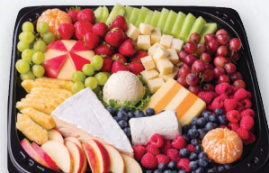
Fine Cheese & Fruit Tray 16" serves 15-20