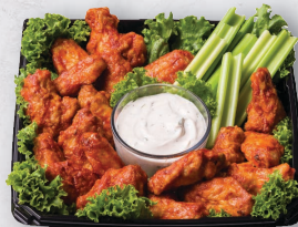
Hot Wing Snack Square Serves 8-10