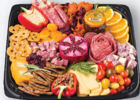
Harvest Tray Rectangle serves 15-20