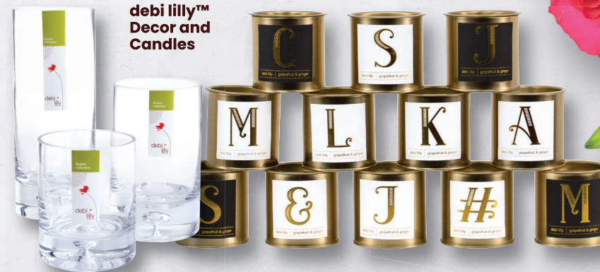
debi lilly™ Decor and Candles