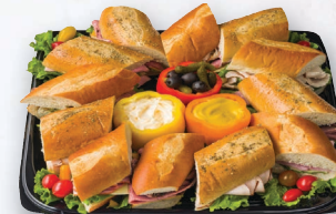
Hoagie Sandwich Tray 18" serves 18-24