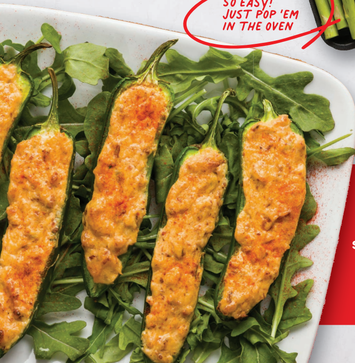
Stuffed Jalapeños Made fresh in store and filled with your choice of Cream Cheese or Cream Cheese with Bacon. Serves 8

Our fresh cut fruit and veggie trays, stuffed mushrooms, asparagus spears and stuffed jalapeños are made with the best produce nature has to offer. We handpick and hand-cut every piece each day, so you get the juicy best.