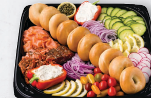
Lox & Bagel Tray 16" serves 10-12