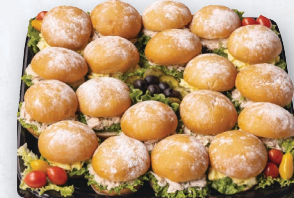
Salad Sandwich Tray 12" serves 10-12 | 16" serves 16-24