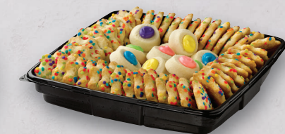
Butter & Susan Cookie Tray Serves 25-30