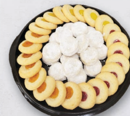
Coconut Thumbprints & Susans Platter Serves 20-25