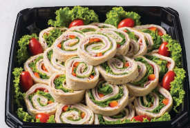
Pinwheel Snack Square Serves 8-10