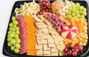
Classic Party Tray 16" serves 15-20