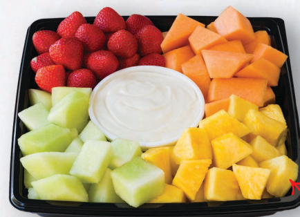
Fruit Tray with Dip ALWAYS AVAILABLE IN PRODUCE! 60 oz