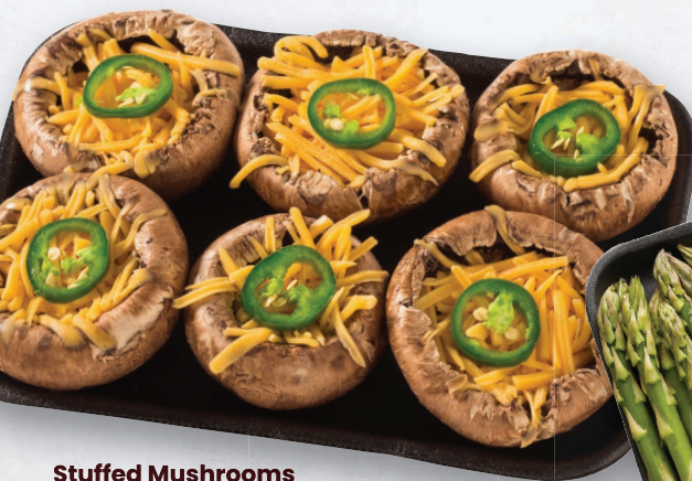
Stuffed Mushrooms Fillings include Jalapeño & Cheddar, Cheddar & Pico de Gallo or Spinach & Mozzarella. Serves 4-6