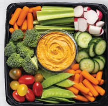
Vegetable & Hummus Snack Square Serves 8-10