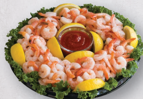
Cooked Shrimp Tray 12" serves 12-14 IN THE MEAT DEPARTMENT