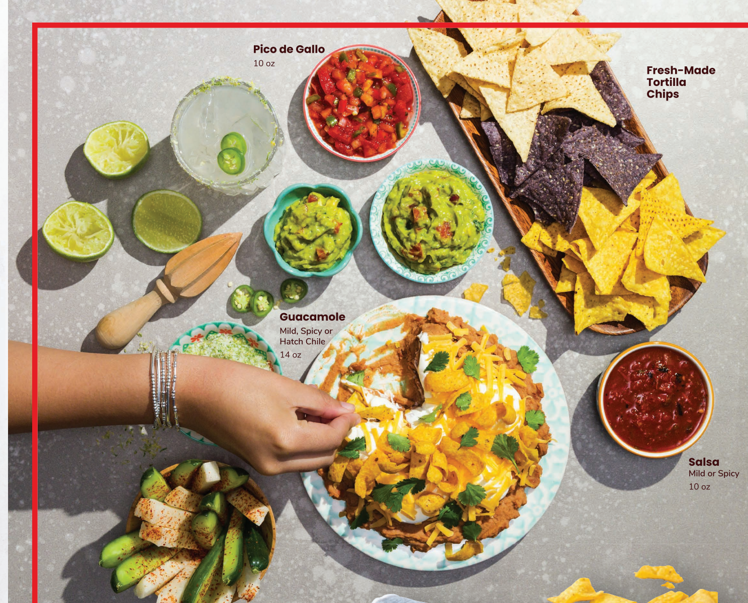
Pico de Gallo 10 oz

Our fresh cut fruit and veggie trays, stuffed mushrooms, asparagus spears and stuffed jalapeños are made with the best produce nature has to offer. We handpick and hand-cut every piece each day, so you get the juicy best.