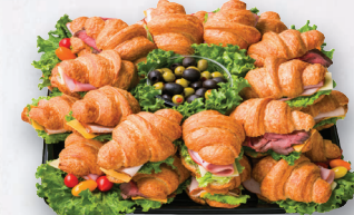
Mini Croissant Sandwich Tray 16" serves 12-16 | 18" serves 16-24