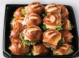
Pretzel Roll Sliders Snack Square Serves 8-10