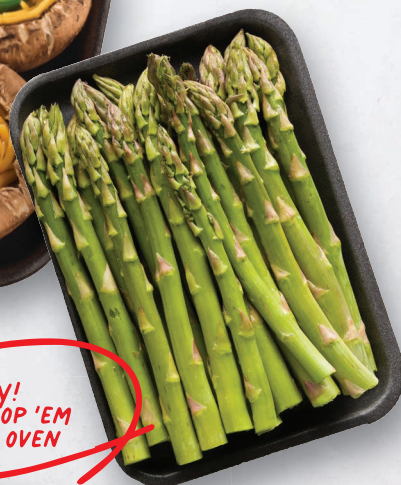
Asparagus Spears Freshly cut and ready for your oven. Serves 2-3