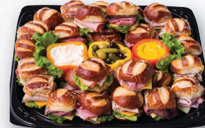
Pretzel Roll Slider Tray 16" serves 25-27 | 18" serves 40-45