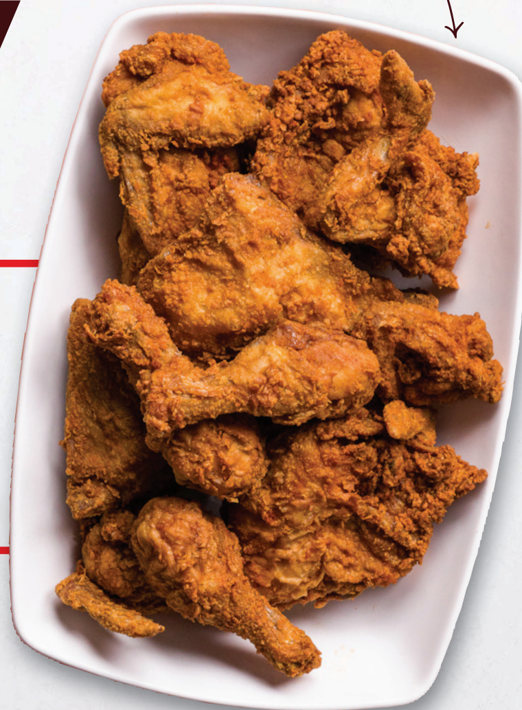
Fried Chicken Our Famous Fried Chicken made in-store daily

Want more chicken? We can increase orders by 50-piece increments!