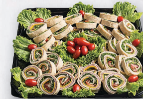
Pinwheel Tray 16" serves 12-16 | 18" serves 16-18