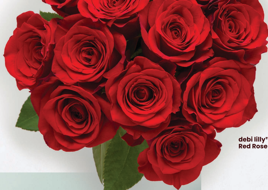
debi lilly™ Red Rose

Handpicked for all your special occasions. We offer beautiful blooms in a variety of colors and styles, so you can choose from an array of made-to-order bouquets and centerpieces, or collaborate with us to create custom floral arrangements.