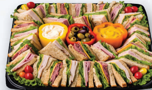
Finger Sandwich Tray 16" serves 12-16 | 18" serves 18-24