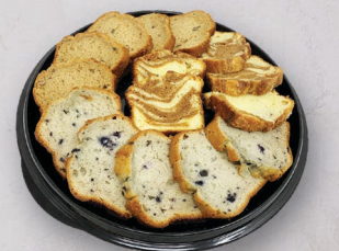
Loaf Cake Platter Serves 8-12