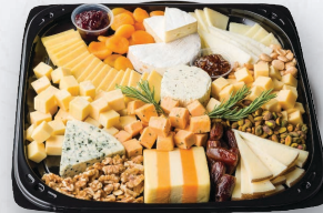
European Cheese Tray Rectangle serves 15-20