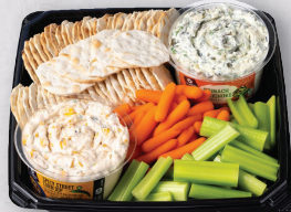
Dip, Vegetable & Cracker Snack Square Serves 8-10