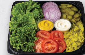
Condiment Tray 16" serves 16-20