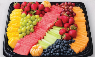
Fruit Tray 16" serves 20-25 | 18" serves 25-30