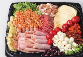
Italian Tray 16" serves 15-20