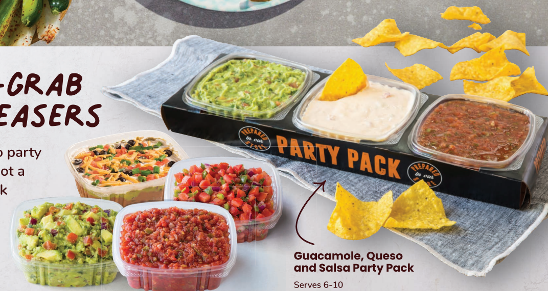
Guacamole, Queso and Salsa Party Pack Serves 6-10

Ingredients and product assortment may vary.