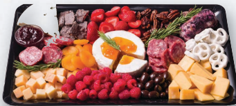
Sweet Treat Cheese Tray Rectangle serves 15-20