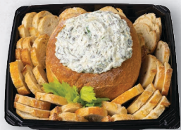
Spinach Dip Boule Snack Square Serves 8-10