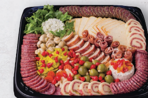
Italian Sampler Tray 16" serves 15-20