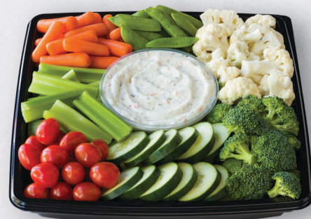
Premium Vegetable Tray with Dip 46 oz