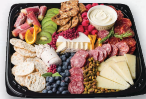
Elegant Charcuterie Tray Rectangle serves 15-20