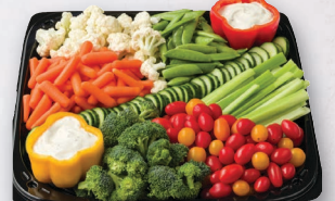
Vegetable & Dip Tray 16" serves 20-25 | 18" serves 25-30